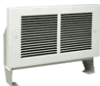
ZA, RA, Z, ZC